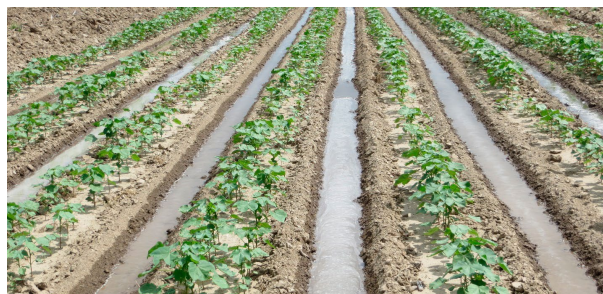
Figure 1. Photograph of 102-cm single-row (SR), and 25-cm twin-row (TR) planting geometries.

not significant (Stephenson and Brecke, 2010). The same study also demonstrated a 24% higher lint yield in the TR system at a plant density of 70,000 plants \text{ha}^{-1} , which they attributed to enhanced canopy intercepted, photosynthetically active radiation (IPAR). In this study, compared to SR, the IPAR measured in TR planting geometry was higher by 55% and 76%, respectively, at 7 and 9 weeks after emergence. But these differences diminished as the season progressed (Pettigrew, 2015). Stephenson and Brecke (2010) and Reddy and Boykin (2010) reported higher plant stand, higher number of open bolls, and earlier canopy closure associated with higher lint yields in TR planting in the MS Delta. Based on a 2-year study conducted at Xinjiang, China, Zhang et al. (2016) reported an optimum plant density of 18.0 plants \text{m}^{-2} for optimum light use efficiency and yield returns. Narrow row width also resulted in greater canopy closure, but this did not consistently translate into yield gains in North Carolina (Riar et al., 2013).